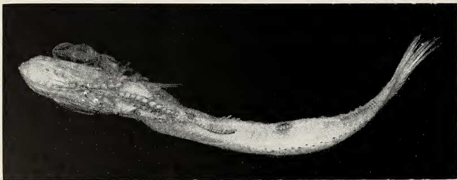
FIG. 4. Argyripnus atlanticus , standard length 35.5 mm.

Measurements in millimeters: depth 8; head 11; snout 2–2.5; orbit ca. 4; interorbital width at center of eye 2–2.5; upper jaw 7–7.5; premaxillary 3–3.5; toothed portion of maxillary 4–4.5; tip of snout to dorsal origin ca. 17, to anal origin 15.5, to ventral base ca. 12.5–13; distance between first anal ray and base of middle caudal rays 18.5–19, last anal ray and base of middle caudal rays ca. 6.5, last dorsal ray and base of middle caudal rays ca. 15; least depth of caudal peduncle 2.5–3; dorsal base 3.5–4; anal base ca. 11.5; pectoral length 6.5–7; adipose base 1.5; distance between VAV-AC group of photophores and group of (5) 3.5